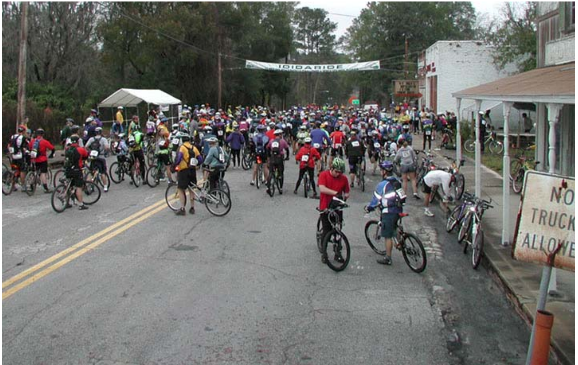
The “start bay” for IDIDARIDE 2002 in front of SBA HQ on January 26th... a gray day, but not too cold as evidenced by riders in shorts. For the first time land managers allowed 250 participants to ride in IDIDARIDE 2002 up from the cap of 200 of previous years. SBA staff learned that 250 is the upper limit that can be comfortably handled at the event. Note an IDIDARIDE banner was flown for the first time.